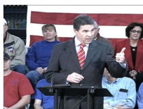
Perry: We need a "part-time" Congress