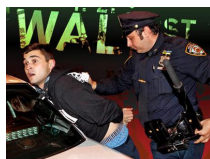
Raw Video: Occupy Protesters Make Their Case