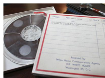
Lost JFK Assassination Tapes on Sale