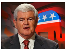
The Gingrich Surge: Can It Last?