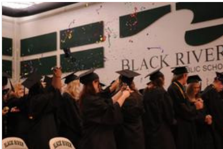
Black River graduates pop confetti during their commencement ceremony Friday night at Black River.